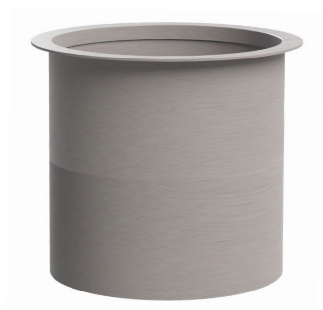
Orenco® Fiberglass Access Risers are available in 24-, 30-, 36-, and 48-inch (600-, 750-, 900-, and 1200-mm) diameters.

The RF24, RF30, RF36, and RF48 fiberglass access risers are designed for use with Orenco FBL access lids The RFD30 fiberglass access riser is designed for use with Orenco's FLD30 lid.