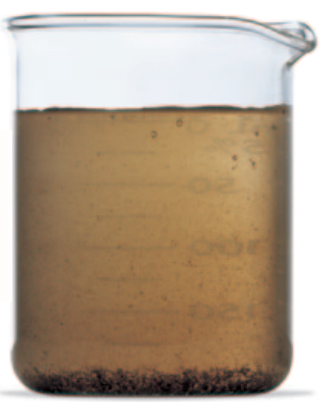
AdvanTex turns household wastewater into clear, odorless effluent you can reuse for subsurface irrigation.

AdvanTex Treatment Systems may cost a little more up front than other systems, but, thanks to low maintenance requirements, they cost much, much less over time. Power costs, pumping costs, and equipment replacement costs are a fraction of those for other technologies. Plus, AdvanTex filters protect your drainfield.