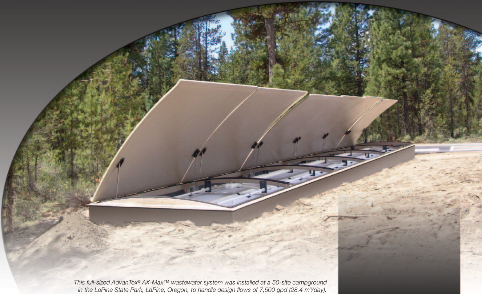
This full-sized AdvanTex® AX-Max™ wastewater system was installed at a 50-site campground in the LaPine State Park, LaPine, Oregon, to handle design flows of 7,500 gpd (28.4 m 3 /day).