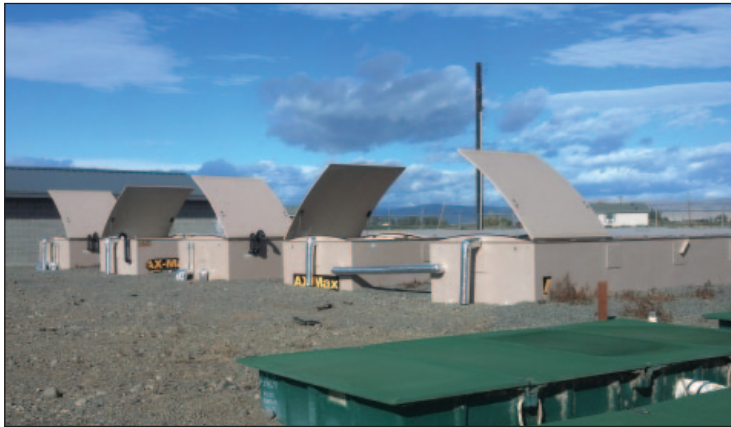
The Yakama Nations Housing Authority in Washington state added five AdvanTex® AX-Max units (background) to its ten AdvanTex AX-100 units, increasing the capacity of its wastewater system by 50%.