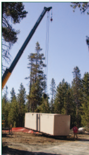
Units range from 14'-42' in length. This 21' unit is ideal for lower flows.

AX-Max systems provide excellent treatment anywhere, and they have been installed all over the world. For example, AX-Max systems have been installed in-ground at Malibu's famous beach parks and New Zealand's resort at Glendhu Bay. Several more were installed in-ground in Soyo, Africa, to serve a new hospital and school. Other AX-Max systems have been installed above-ground on top of Alaska's frozen tundra and St. Lucia's volcanic rock. Still more have been installed above-ground in mining camps from Alberta to Texas and, in the Midwest, at a U.S. Department of Defense demo site.