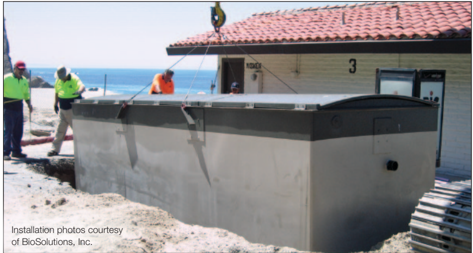
Installation photos courtesy of BioSolutions, Inc.